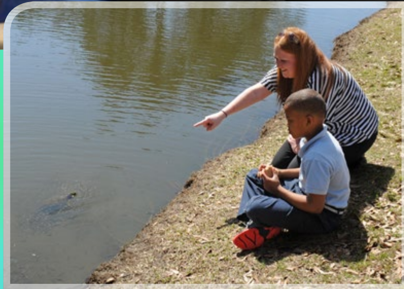
Nature plays a prominent role in meeting the therapeutic needs of our children at BayPointe.